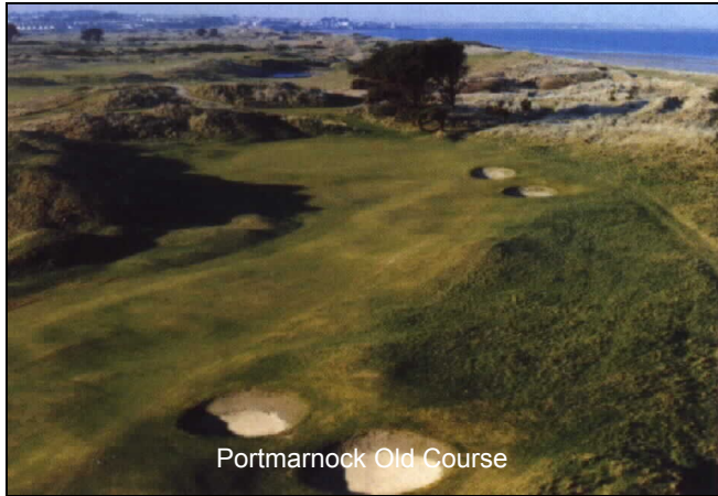
Portmarnock Old Course