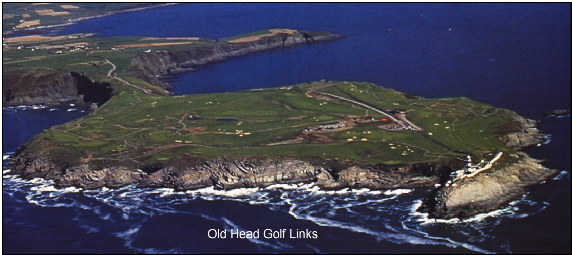
Old Head Golf Links